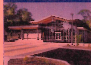
The Blue Ridge Parkway Visitor Center.