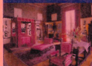
Grand Victorian architecture.