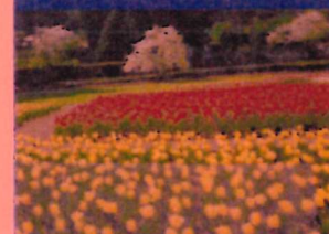
One of the Biltmore's many gardens.